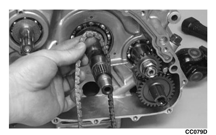
10. Install the primary driven washers and shims onto the driveshaft and crankshaft.