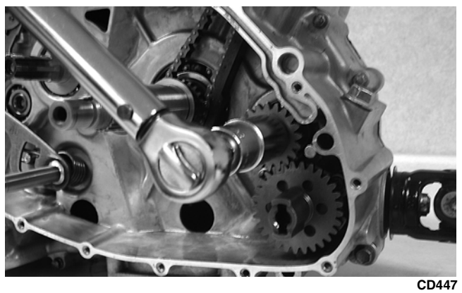
9. Place the chain into the crankcase; then secure it from the top side with a wire for ease of installing.