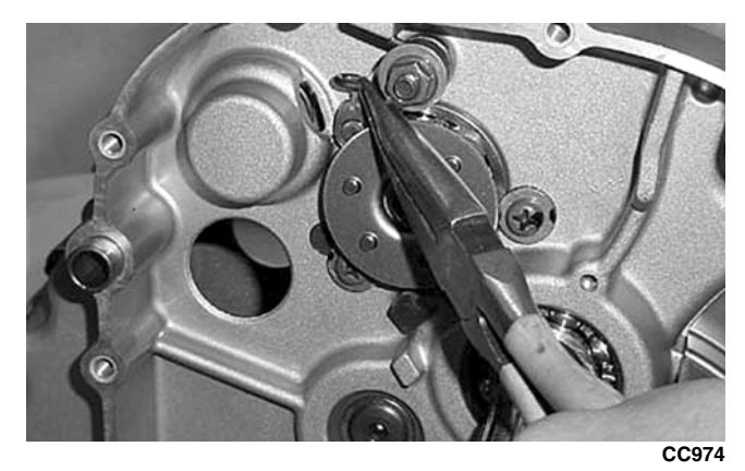
7. Install the gear shift shaft.